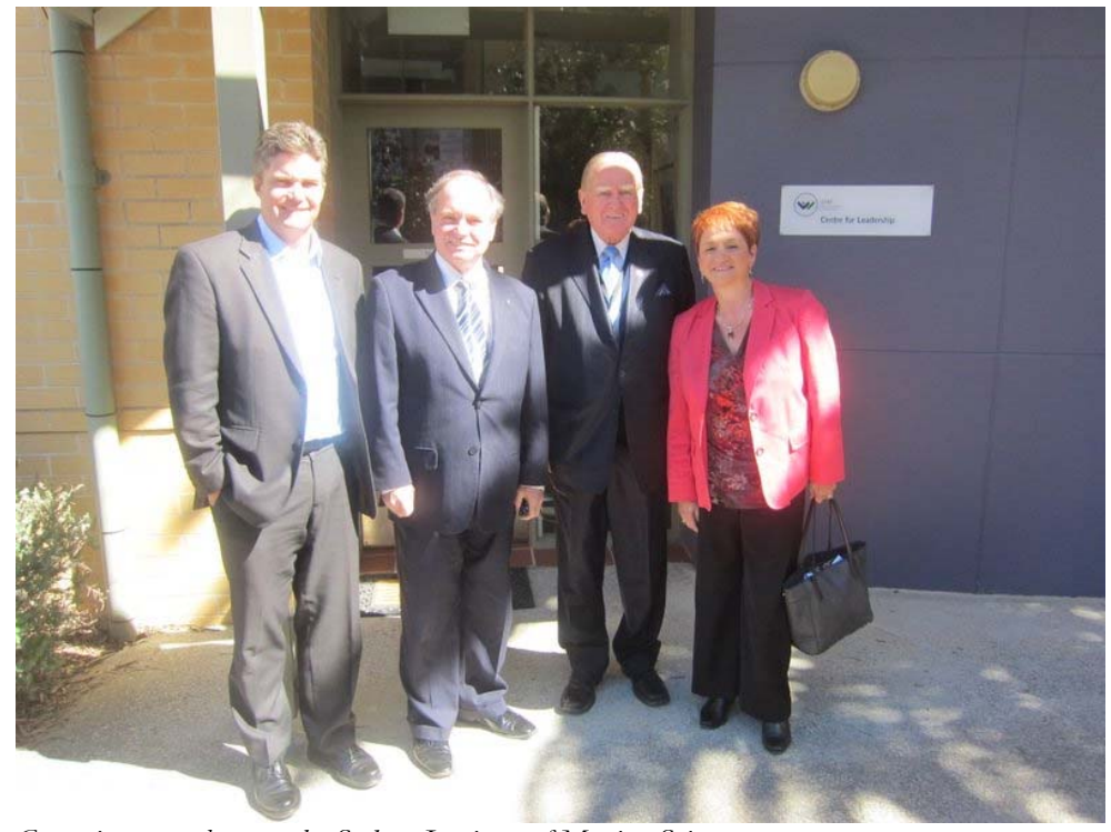
Committee members at the Sydney Institute of Marine Science.

1.23 Later that month, on Friday 31 August 2012, the Committee visited the Sydney Institute of Marine Sciences (SIMS) located at Mosman. SIMS is one of the destination locations for scientific research. The Committee gained first-hand insight into the science carried out at SIMS and heard about plans to expand some aspects of the site.