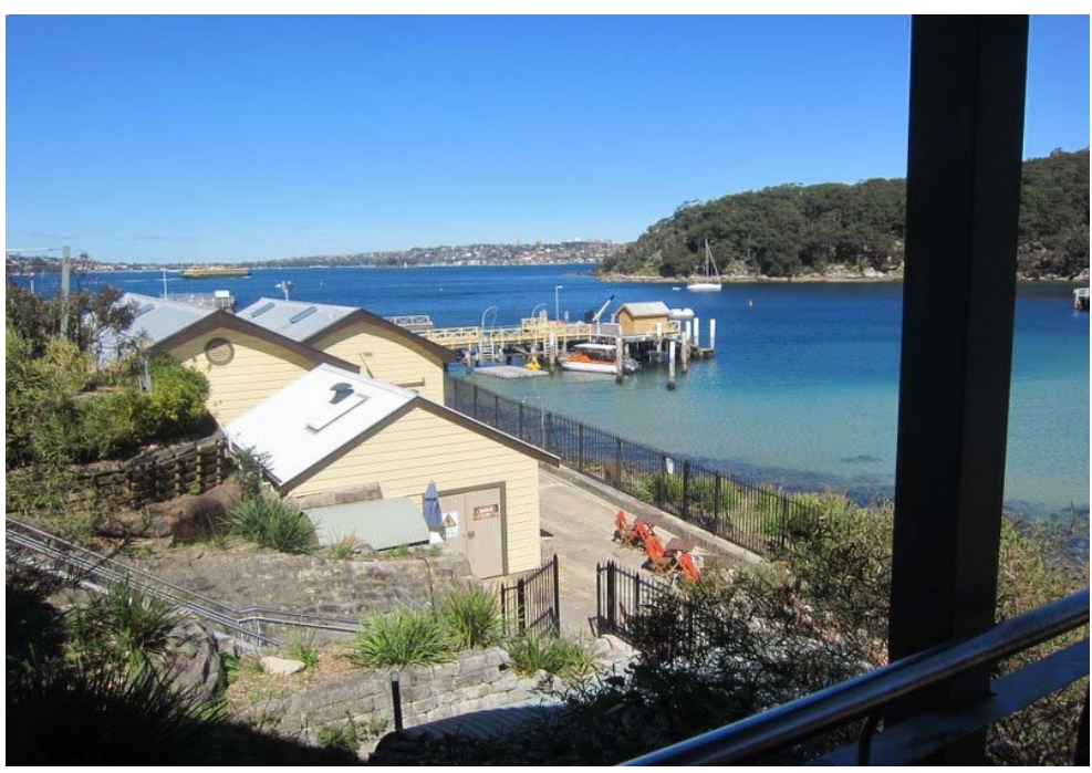
Sydney Institute of Marine Science.

1.24 On Friday 28 September 2012 the Committee undertook a site visit to the Port Stephens Fisheries Institute at Taylors Beach. Port Stephens is also earmarked as a destination for some of the CFRC scientists. The Committee was provided with a detailed tour of the site and observed scientific experiments in progress.