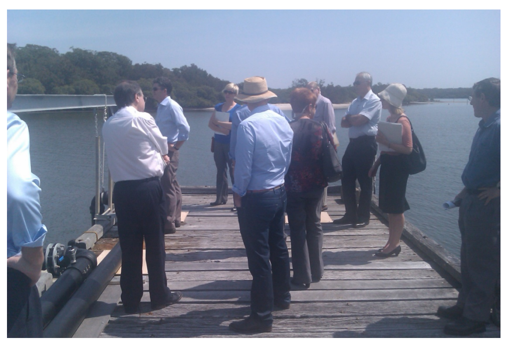
Committee members at the Port Stephens Fisheries Institute.

1.24 On Friday 28 September 2012 the Committee undertook a site visit to the Port Stephens Fisheries Institute at Taylors Beach. Port Stephens is also earmarked as a destination for some of the CFRC scientists. The Committee was provided with a detailed tour of the site and observed scientific experiments in progress.