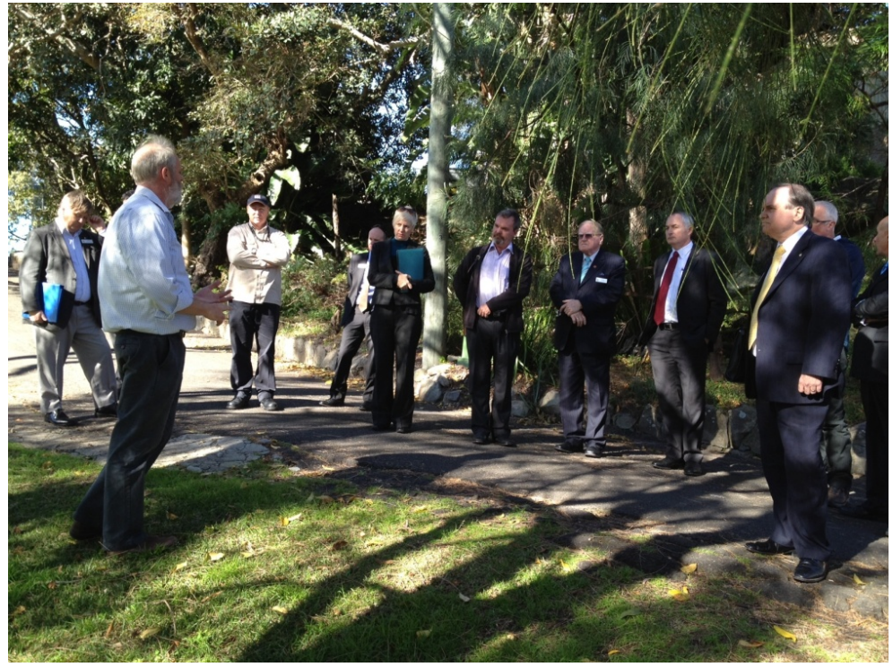
Committee members at the Cronulla Fisheries Research Centre of Excellence.

1.23 Later that month, on Friday 31 August 2012, the Committee visited the Sydney Institute of Marine Sciences (SIMS) located at Mosman. SIMS is one of the destination locations for scientific research. The Committee gained first-hand insight into the science carried out at SIMS and heard about plans to expand some aspects of the site.