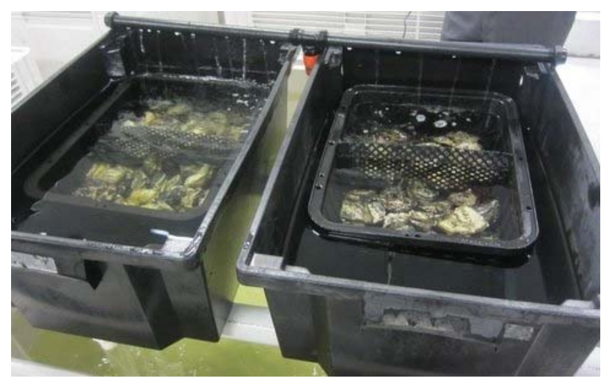
Oyster research at the Port Stephens Fisheries Institute.

1.25 A list of the site visits undertaken by the Committee and the staff who met with the Committee is at Appendix 4 .