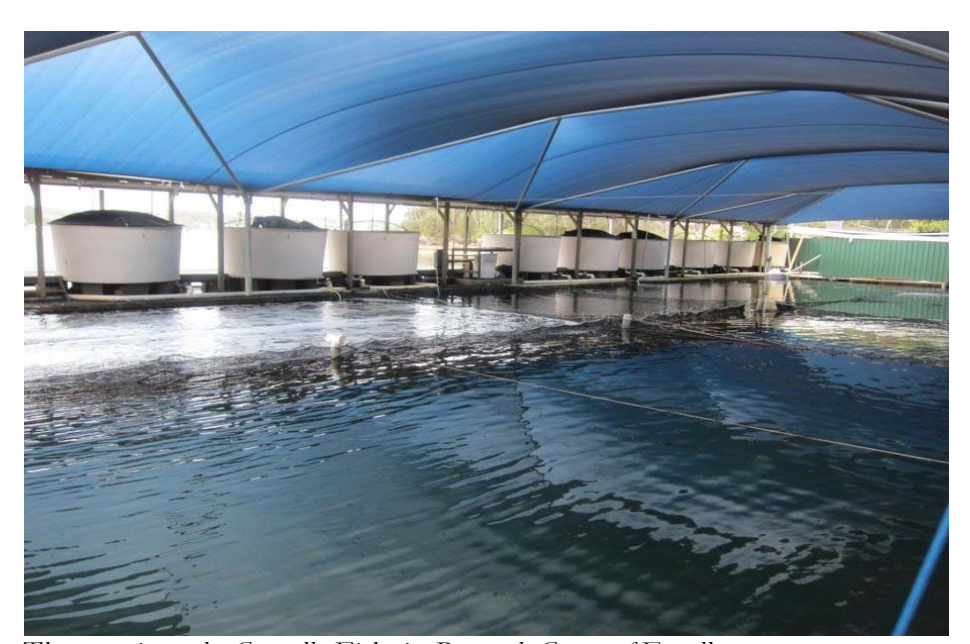
The aquaria at the Cronulla Fisheries Research Centre of Excellence.

1.22 On Monday 6 August 2012 the Committee undertook a site visit to the CFRC. The Committee was provided with a briefing from the Cronulla Fisheries staff and toured the facility. This visit greatly assisted the Committee's understanding of the CFRC and the work conducted there.